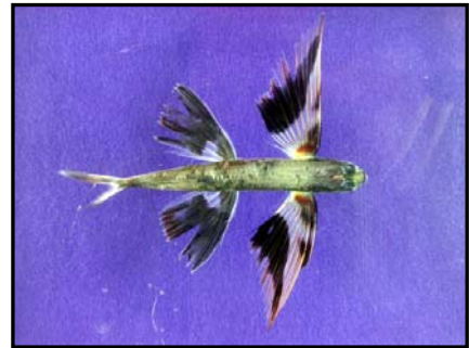
The band-wing flying fish.

Flying fish are a unique because they launch themselves out of the water and "fly" through the air using their tails and their wing-like fins. Scientists do not know for sure why they fly but it might be to escape predators or to save energy while traveling long distances.